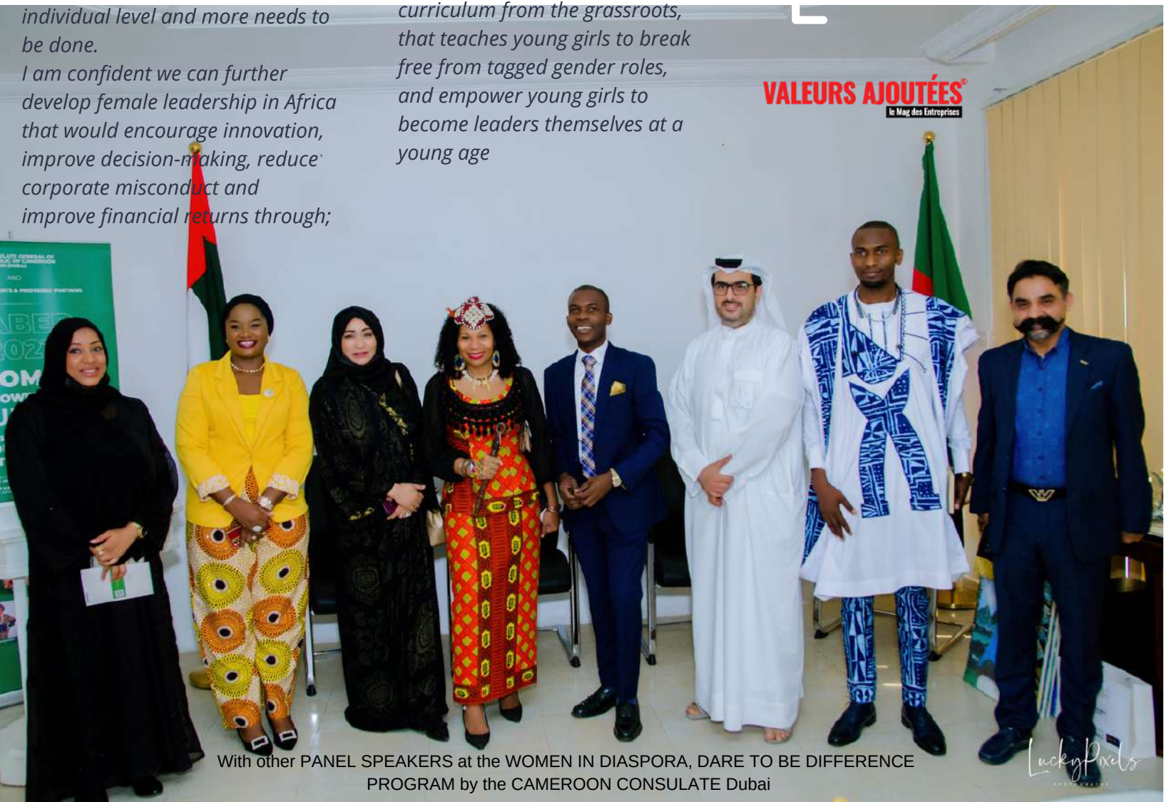
With other PANEL SPEAKERS at the WOMEN IN DIASPORA, DARE TO BE DIFFERENCE PROGRAM by the CAMEROON CONSULATE Dubai

There should be clear timelines drawn for work and personal/family life. The two should not overlap. Most importantly, women should learn how to say NO when necessary.